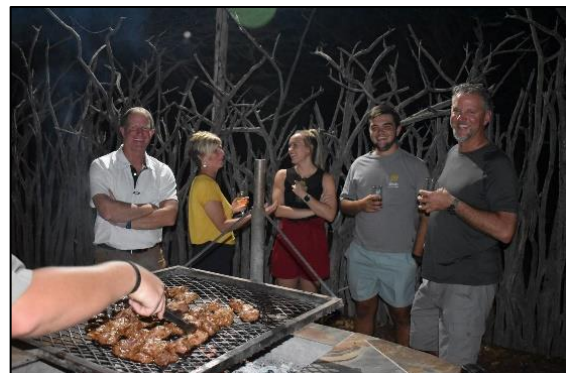
Drinks around the BBQ